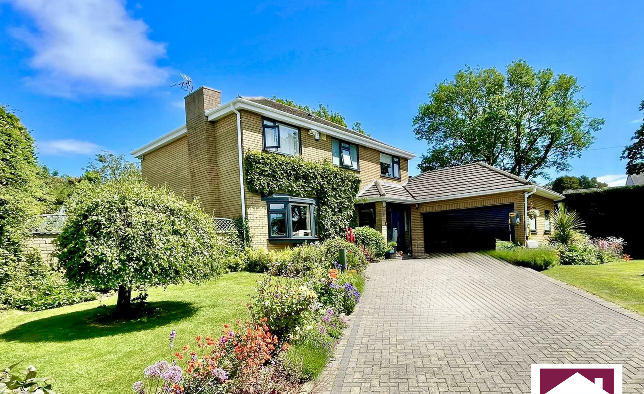
Hightrees Copthorn Road Colwyn Bay LL28 5YP